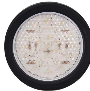
Reverse 110WMG - Single Blister 110WMB - Light Only Bulk