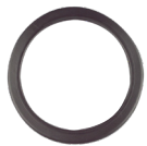
Part No. 53101 Rubber Grommet