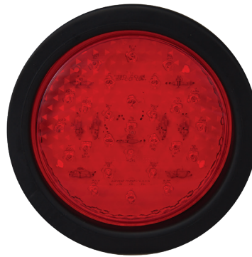
Stop/Tail 110RMG - Single Blister 110RMB - Light Only Bulk