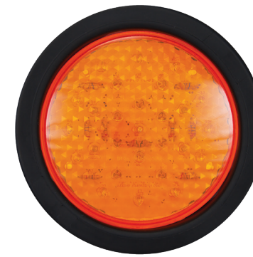
Rear Indicator 110AMG - Single Blister 110AMB - Light Only Bulk