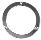
Part No. 53101C Chrome Bkt