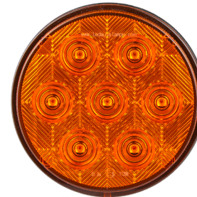
Rear Indicator 113AMB - Light Only Bulk