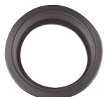
Part No. 53401 Rubber Grommet