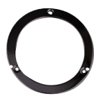
Part No. 53101B Black Bkt