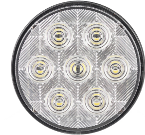
Reverse 113WMB - Light Only Bulk