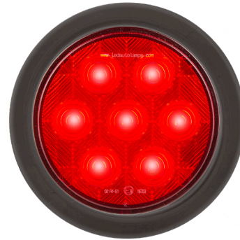
Stop/Tail 113RMG - Single Blister