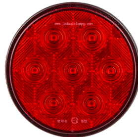
Stop/Tail 113RMB - Light Only Bulk