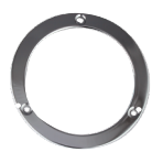
Part No. 53101C Chrome Bkt