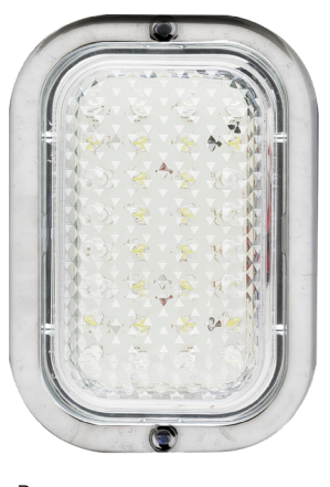
Reverse 130WMC - Single Blister