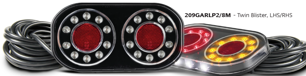
209GARLP2/8M - Twin Blister, LHS/RHS