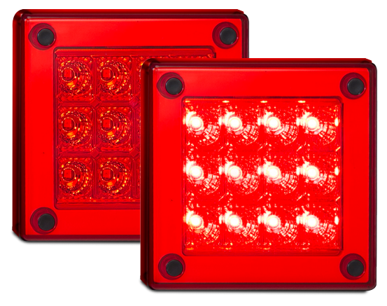
Stop/Tail 280RM - Single Blister