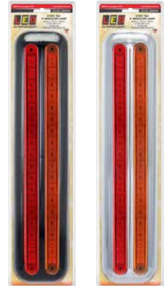
Stop/Tail/Indicator 380CAR12 - Blister