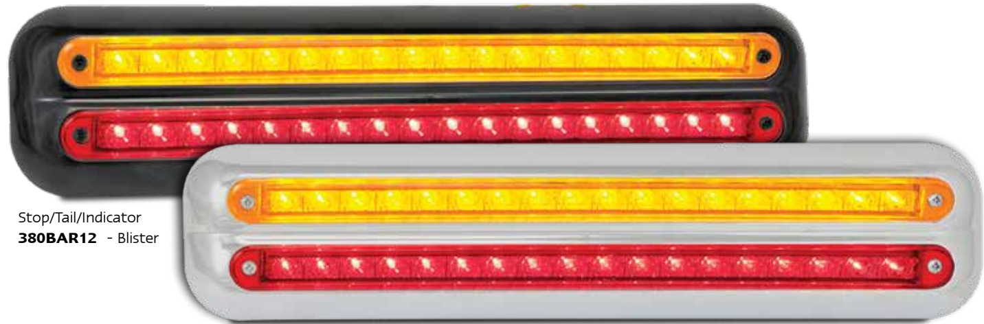
Stop/Tail/Indicator 380BAR12 - Blister