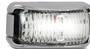
Part Number 42CWMB - Order 42WMB and 10x42BC