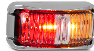
Part Number 42CARMB - Bulk Box of 10