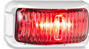
Part Number 42WRMB - Bulk Box of 10