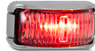
Part Number 42CRMB - Order 42RMB and 10x42BC