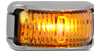
Part Number 42CAMB - Order 42AMB and 10x42BC