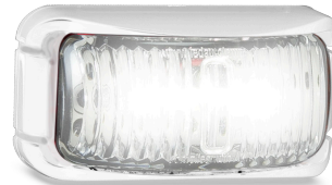
Part Number 42WWMB - Bulk Box of 10