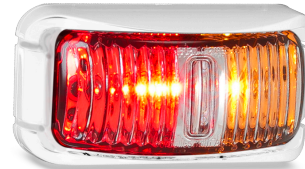
Part Number 42WARMB - Bulk Box of 10