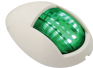
Part Number 52WG - Blister