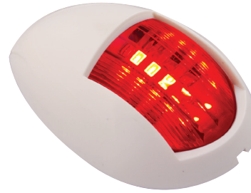
Part Number 52WR - Blister