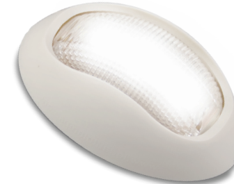
Part Number 52WW - Blister