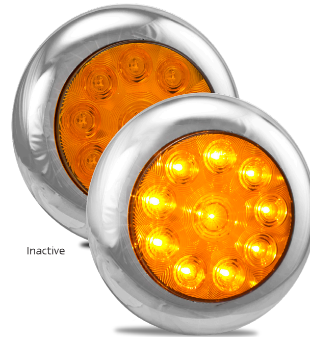
Stop/Tail 5543RM - Blister