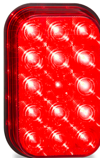
Stop/Tail 5940RMB - Bulk