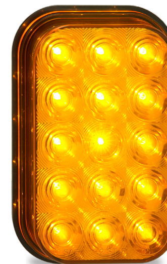
Rear Indicator 5940AMB - Bulk