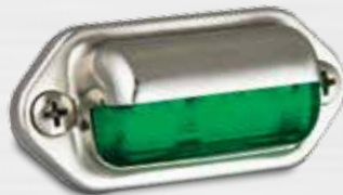
Part Number 6505GM - Multivolt 12-24V Blister single