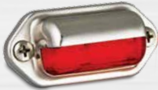
Part Number 6505RM - Multivolt 12-24V Blister single