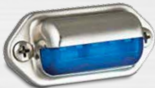
Part Number 6505BM - Multivolt 12-24V Blister single