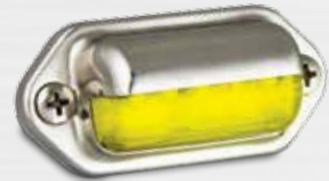
Part Number 6505YM - Multivolt 12-24V Blister single