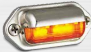
Part Number 6505OM - Multivolt 12-24V Blister single