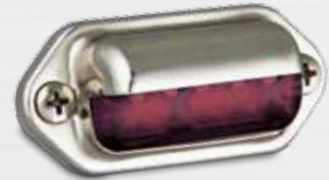
Part Number 6505PM - Multivolt 12-24V Blister single