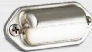
Part Number 6505IM - Multivolt 12-24V Blister single

Function Courtesy step lamp Size 65mm x 30mm x 24mm Voltage Multivolt 12-24V LED Qty 5 Cable 30cm cable