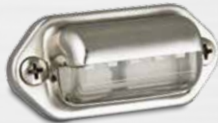
Part Number 6505WM - Multivolt 12-24V Blister single