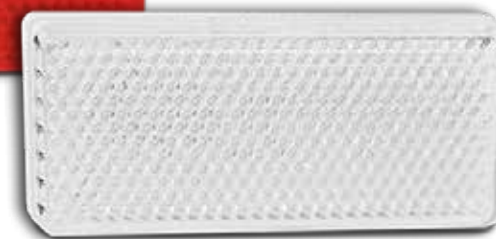
7030W - Twin Blister 7030WB - Box of 100

Function Reflex Reflector Size 70mm x 30mm x 6mm Lens PMMA Base ABS