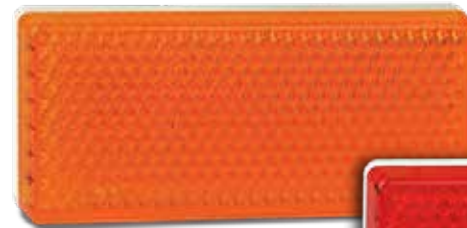
7030A - Twin Blister 7030AB - Box of 100