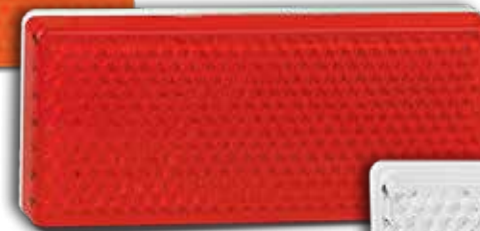
7030R - Twin Blister 7030RB - Box of 100