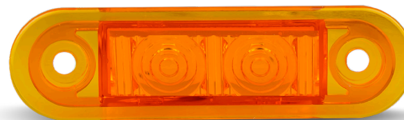
Part Number 7922AM2 - Twin Blister