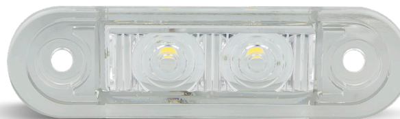
Part Number 7922WM2 - Twin Blister