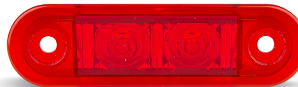
Part Number 7922RM2 - Twin Blister