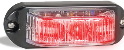
90RM - Blister