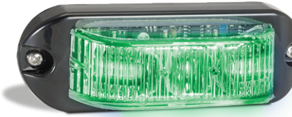
90GM - Blister