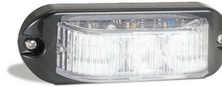
90WM - Blister