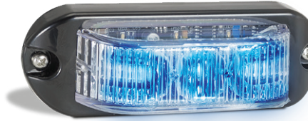
90BM - Blister