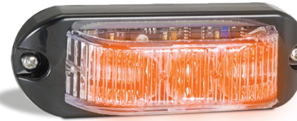
90AM - Blister