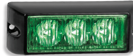
93GM - Box