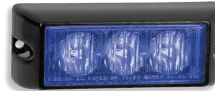
93BM - Box