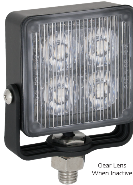
Clear Lens When Inactive