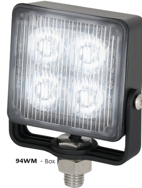
94WM - Box