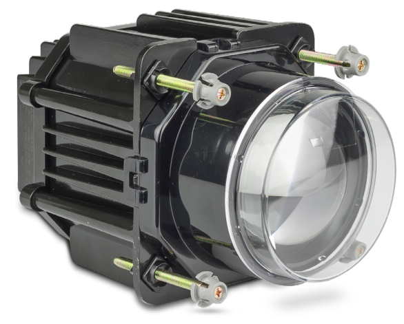
Part Number HL91 - High Beam/Low Beam, Box