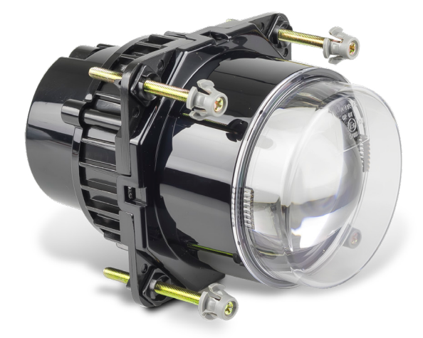
Part Numbers HL92 - Low Beam, Box

ApprovalsFunctionNo.CTAHL92 ECELow BeamE6-112R-010523060279