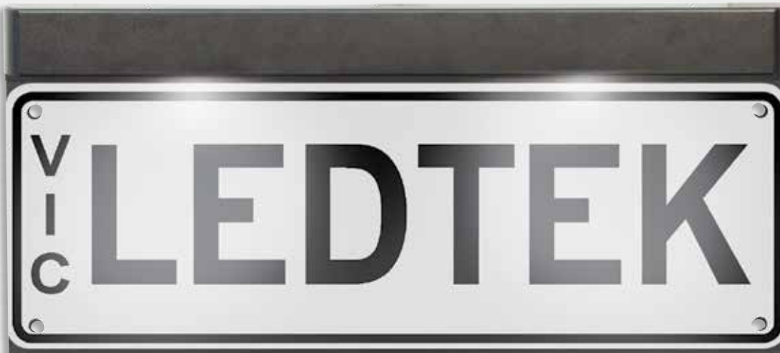
LP1 with sample of licence plate fitted

Approvals Function Category CRN ADR Licence 1/100 39611