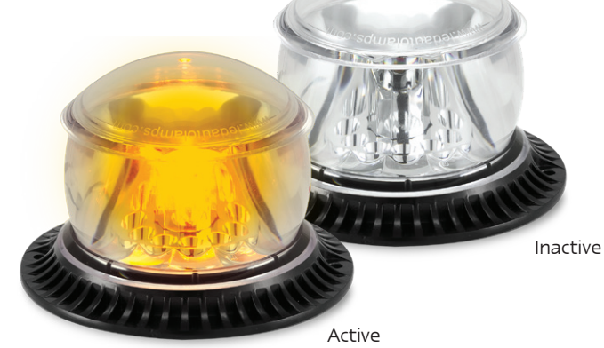
Amber Strobe Beacon, Clear Lens MB12AMC - Blister